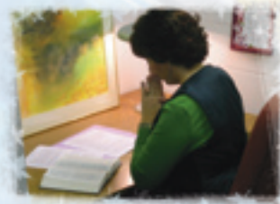
A staff member uses the newly dedicated prayer room at the FaithSearch offices in Haska, MN.

left the temple, serving night and day with fastings and prayers” (Luke 2:36-38). This Christmas, let us be found likewise occupied, with our eyes lovingly fixed upon Him, the “author and perfecter of our faith” (Hebrews 12:2).