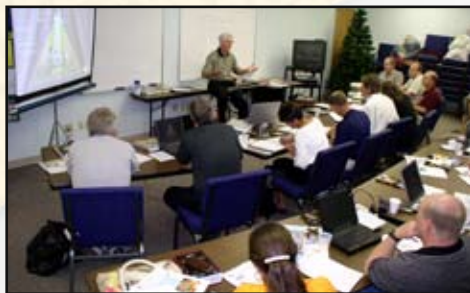
FaithSearch Discovery Teacher Training, July 2005

The biblical principle of multiplication (2 Timothy 2:2) is central to our Extending the Vision strategy, both in the USA and around the world. We are training others to include the FaithSearch message—the Gospel with evidence—in their own ministries. This enables the Gospel with evidence to go places we do not go; to reach people we never see; to “speak” languages we ourselves don’t speak.