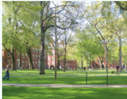
Colleges and universities—both secular and Christian—are the focus of the FaithSearch ministry thrust "Vision for America."

This country's future leaders and influencers—our lawyers, nurses, pastors, teachers, politicians, CEOs, doctors, broadcasters, etc.—are enrolled in our colleges and universities today. Perhaps the most effective way to impact positively the next fifty years of America is to spiritually captivate, transform and equip these students' hearts for Christ.