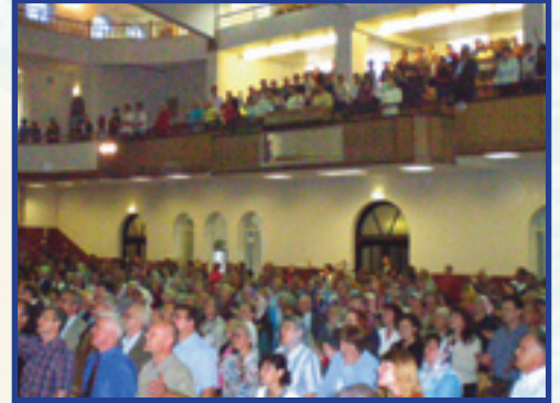
Some of nearly 1,000 who gathered in anticipation of FaithSearch Discovery in Minsk, Belarus.