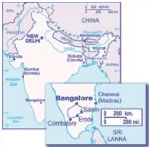
The 2003 FaithSearch training events were offered in four cities in southern India.

These books are offered in conjunction with training in the use of FaithSearch