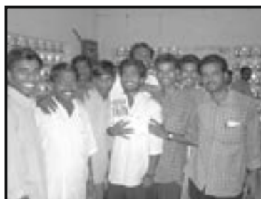
Pastors and lay leaders in India happily show off their copies of Surprised By Faith

There is nothing more gratifying and humbling than to receive the thanks of one who has experienced the peace and forgiveness of God for the first time. And we in turn express our thanks to you for "participating in the Gospel" with us.