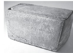
(Identify picture above)