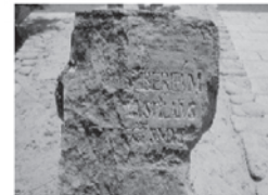
(Identify picture above)