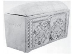
(Identify picture above)